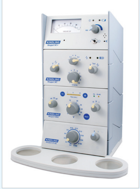
Akuport-Tower complemented with Akuport D-tec